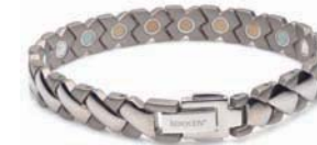
Titanium Link Bracelet for men and women