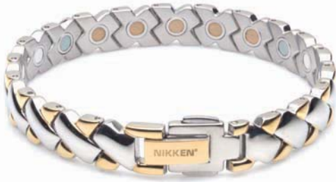
Two-Color Link Bracelet (goldtone/silvertone) for men and women