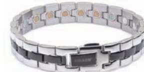
Men’s Classic Stainless Steel Bracelet (black/silvertone)