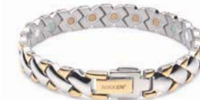
Two-Color Link Bracelet (goldtone/silvertone) for men and women