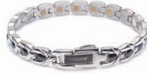
Women’s Braided Stainless Steel Bracelet (black/silvertone)

Nikken dress bracelets with TriPhase Technology are available in four styles: